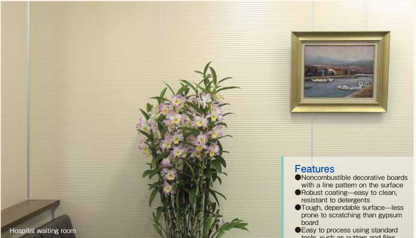
Hospital waiting room