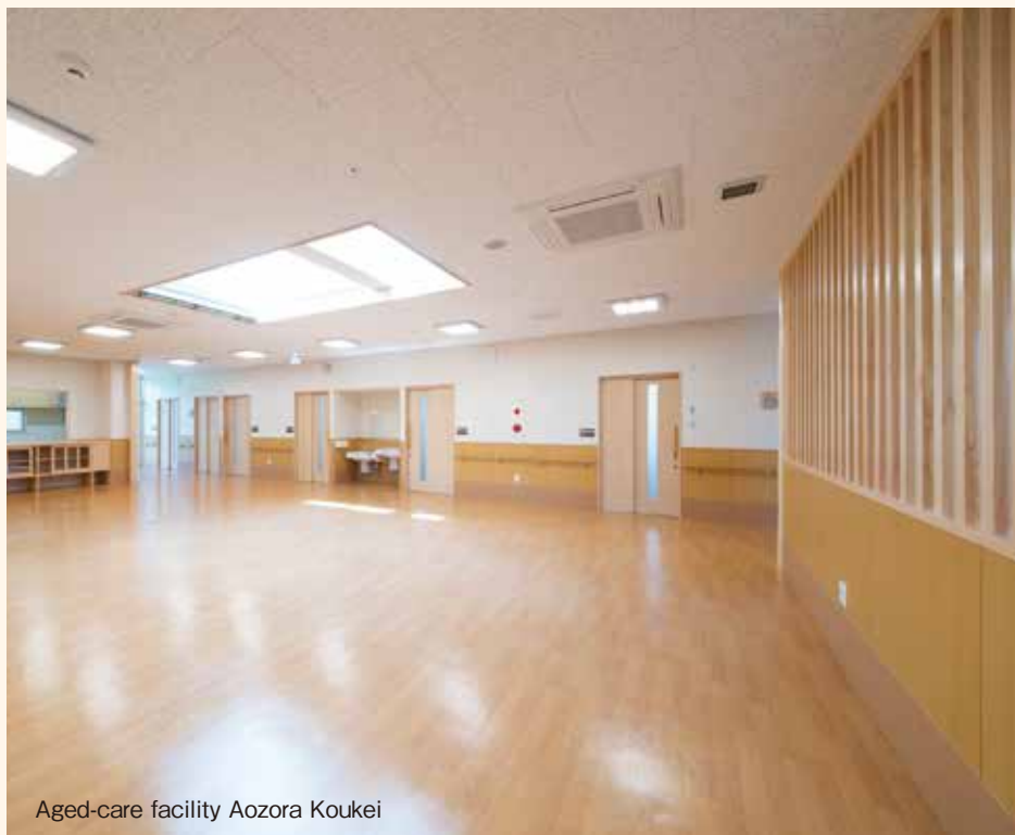
Aged-care facility Aozora Koukei